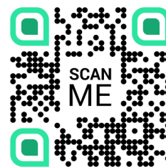
Mask fitting for NIV