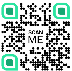
Partially blocked Tracheostomy