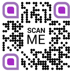
Stellar 100 & 150