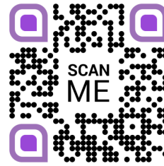
Nippy Junior +