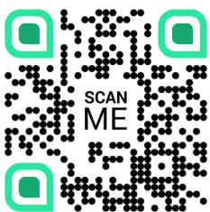
Pressure sores & NIV