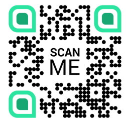
Suctioning a tracheostomy